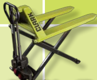
Manual Scissor Lift