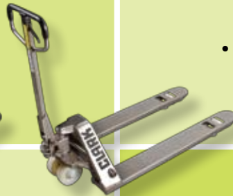
Stainless & Galvanized