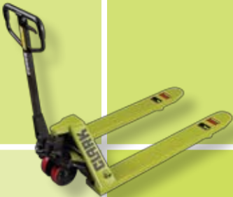
Standard / Tandem Quick Lift / 4-Way