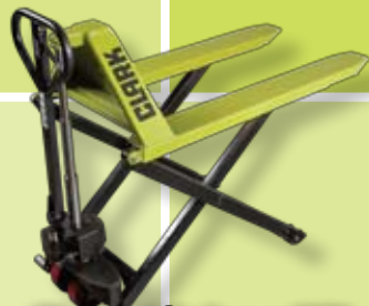
Manual Scissor Lift