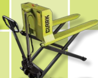
Battery Scissor Lift