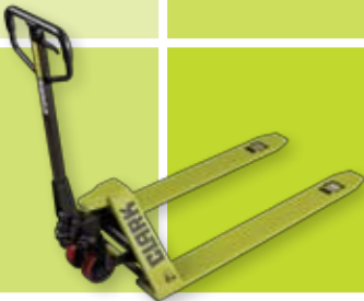
Low & Super Low Profile